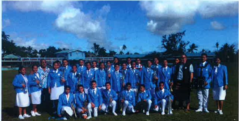
Above: Students glad to be back in their school after Cyclone Gita