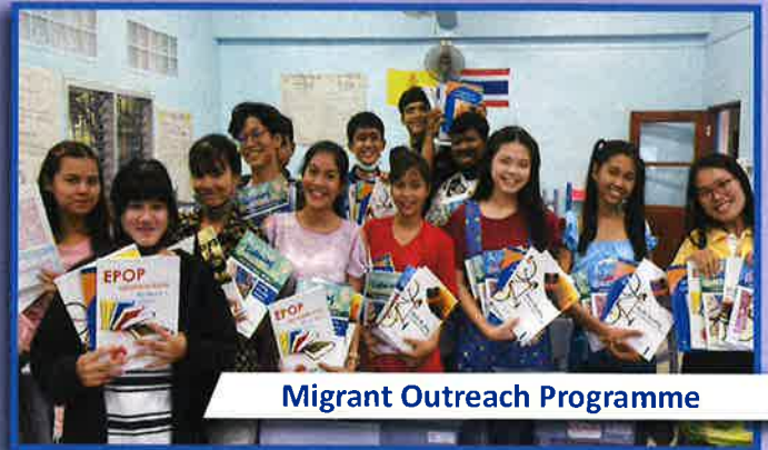
Migrant Outreach Programme