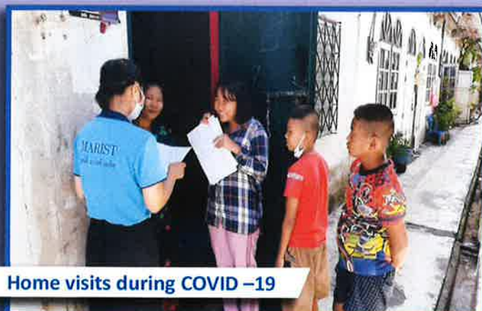
Home visits during COVID-19

Left are the Burmese Migrant Secondary Programme Teachers. They are a wonderful team full of enthusiastic migrant teachers for our migrant children. They bring a new sense of hope and dignity to the whole community and are the future of the Burmese Refugee community in Ranong.