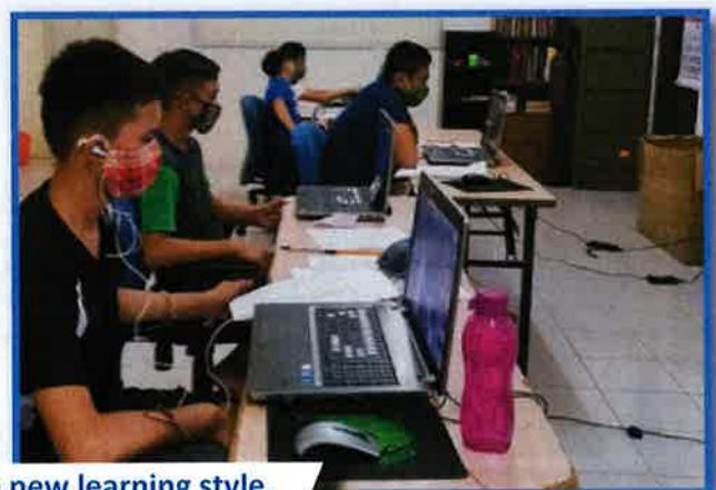
The boys adjusting to the new learning style.