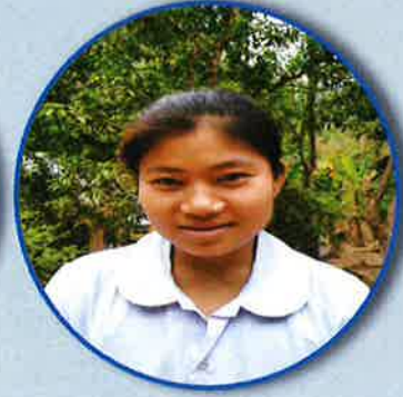
Some of the students who have completed their studies