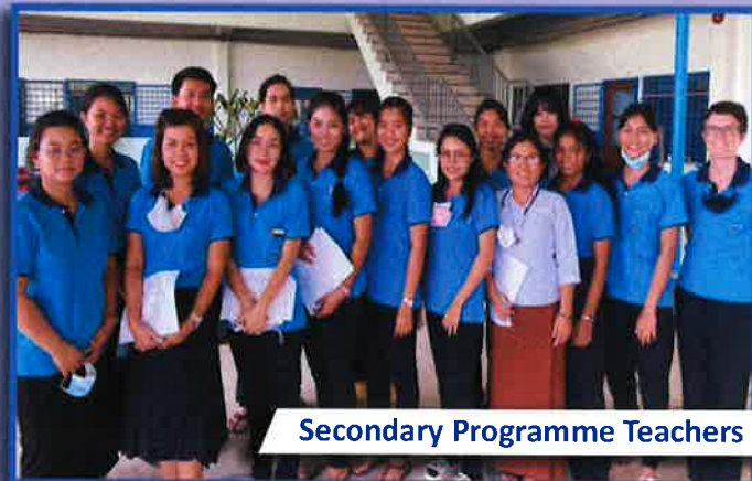
Secondary Programme Teachers

Left are the Burmese Migrant Secondary Programme Teachers. They are a wonderful team full of enthusiastic migrant teachers for our migrant children. They bring a new sense of hope and dignity to the whole community and are the future of the Burmese Refugee community in Ranong.