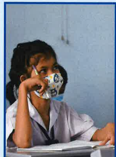
Learning in COVID-19 Marist Asia Foundation Ranong