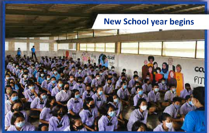
New School year begins

Education is highly valued in the Burmese refugee community. These migrant students are aiming higher with their English learning. They want to get a better job or a scholarship to University courses and now have the chance to complete 6 months of learning. The Students in Ranong are preparing for the entrance test to the Australian Catholic University Online Diploma Programme in 2021.