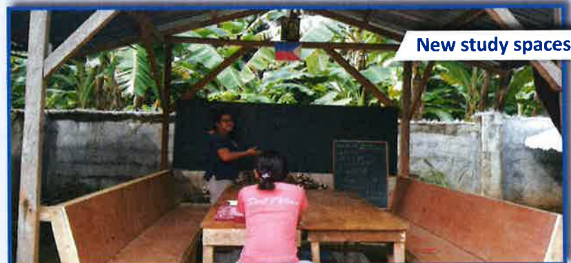
New study spaces

These young girls can now live and learn in a safe and secure environment supported by the caring sm sisters and staff.