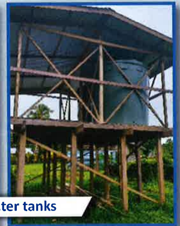
New water tanks