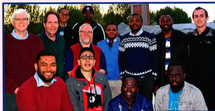
Above: Our hope for the future