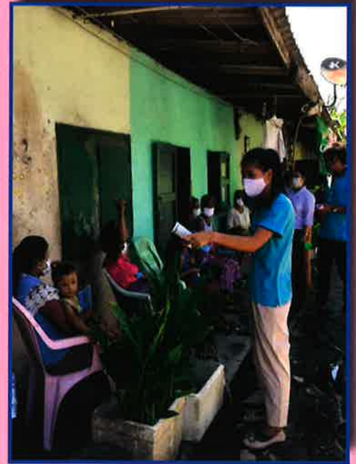
Above and Left: A welcome visit during COVID