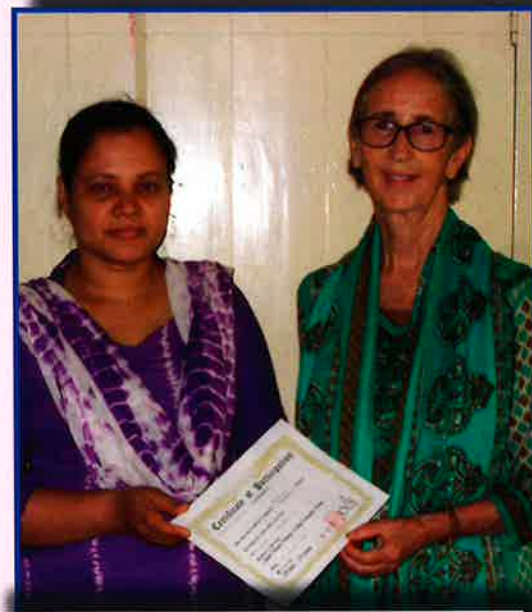
Above: The gift of transformation