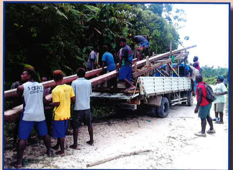
Above: The men have their teams for the next stage of carting the timber to the building site.

'All hands make light work': The active involvement of the whole community has significantly reduced the overall cost of this project and will make an important contribution to the morale and spirit of the whole community.