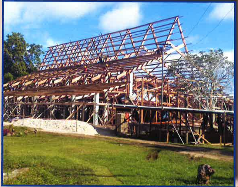
Above: The old and the new

The original parish church in the community of Dala has deteriorated beyond repair due to the severe weather conditions in the Solomon Islands. The whole community is actively involved with the project to build their new church. This involves everyone participating in all aspects of the project including the very demanding and difficult work of cutting and carting timber from the bush to the building site.