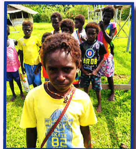
Tabago Buin Bougainville