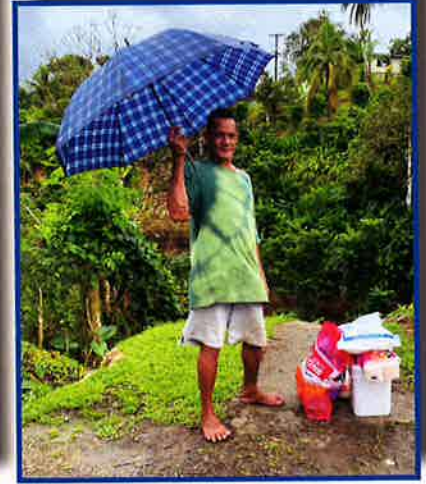
Above: A welcome relief for urban and rural families