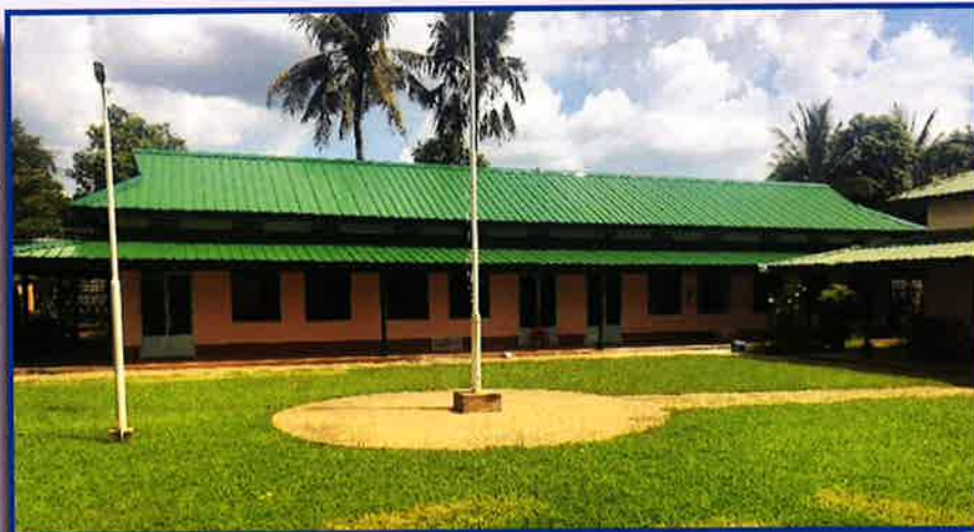
Above: Completed Restoration

Marist Solidarity Cambodia is very grateful for the support the Marist Mission Centre has given in this renovation.