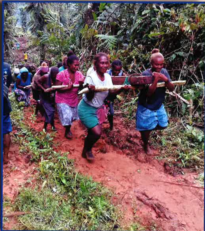
Above: The women have formed themselves into work teams and are doing the hard work of carrying the timber from the bush to the trucks