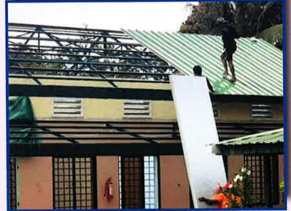
Above: New Roofing

Ceilings in the rooms were repaired and repainted and/or replaced in each of the eight classrooms.