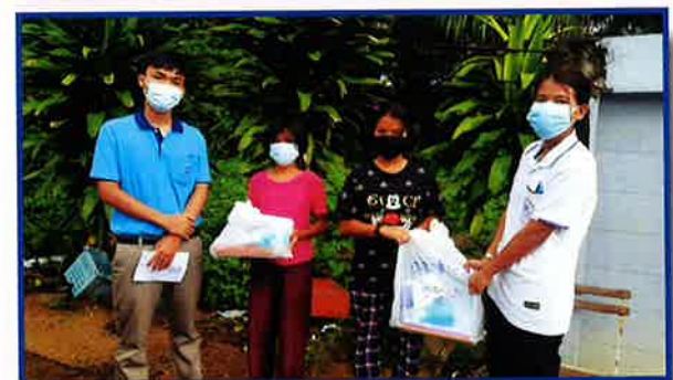
Above: Greatful families receiving supplies