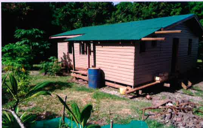
Above: A Place to live & work

MMC has funded plants and seedlings and the building of a house for families to live in while they work on the restoration of their island home.