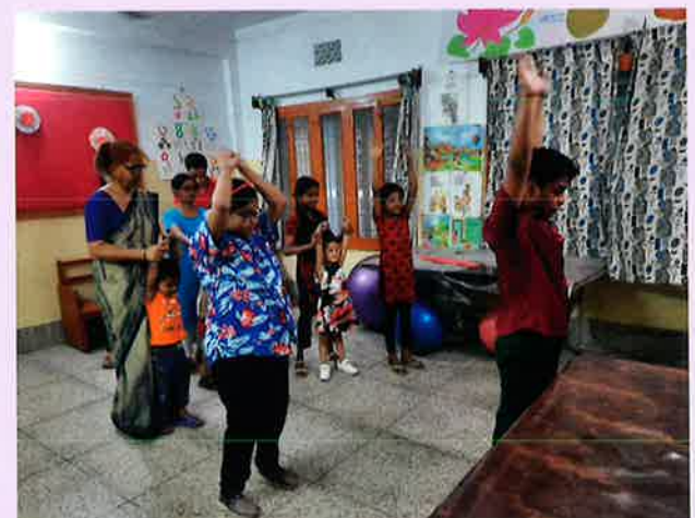
Right: Physical Exercise

The program includes a variety of basic life skills such as: physical exercise, washing hands, feeding, dressing and showering oneself, performing household tasks, making crafts and social skills such as good manners and behaviour towards themselves and others.