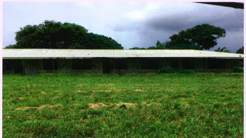
Above: Old Classroom Buildings

The old building was previously used for education purposes and will now be restored for the education of children and the building up of faith within the community.