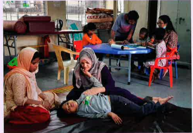
Above: Learning and Healing

In the foreground a young child is receiving physiotherapy while the mother is sitting beside them learning the massage technique to be conducted at home.