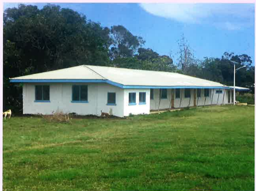
Right: New Buildings

The new building is surrounded by an open area suitable for play and other activities for a kindergarten.