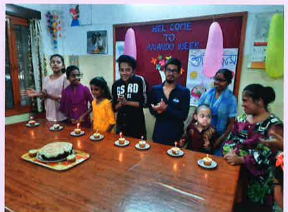
Right: Birthday celebration at Anondo Neer