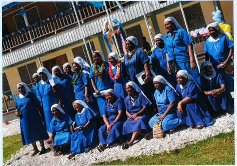
Right: DMI Sisters Celebrating

The Daughters of Mary Immaculate (DMI's) are a Diocesan Congregation of Religious Sisters in the Solomon Islands founded with the support of the SMSM Sisters. They are part of our MMC Marist network and partners in the Solomon Islands. These local Religious women have identified the support and education of women as a key priority of their ministry.