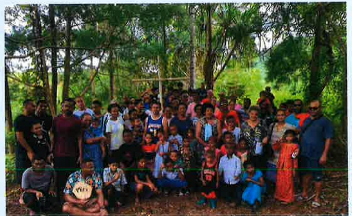
Above: Good Friday Cross Walk Coming together in faith