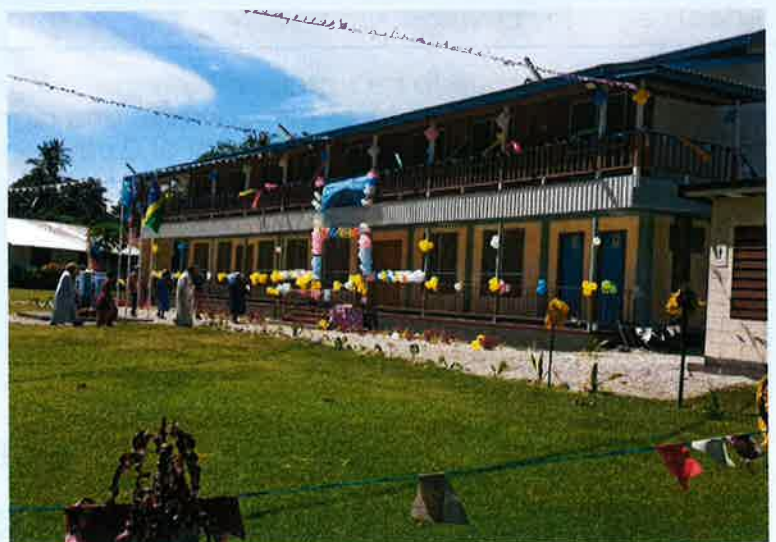
Right: Education—Building our future

The building was funded by MMC in partnership with the Solomon Island Department of Education and is located in a beautiful rural setting near the sea. This is an ideal setting for these young women to live and learn and to look to the future with hope and dignity.