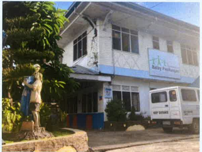
Above: A safe place to live and learn

The boys are now able to live in the Centre with dignity and hope.