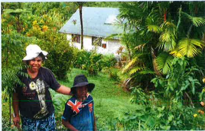
Above: Working in the gardens

Faith and life go hand and hand in Fiji and the parishioners value the opportunity to spend some time at the Centre for prayer, reflection and sharing their experiences. The Legion of Mary is one of the many groups who attend the Centre for prayer days.